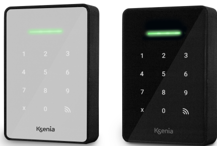
KS12100031.312 - black with 15 m cable